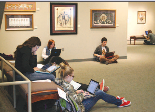
Writing Class Visits CWS