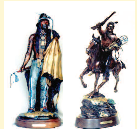
Bronzes by sculptor Michael Westergard

The exhibit is made possible with funding from the Eide/Dalrymple Gallery, South Dakota Arts Council, National Endowment for the Arts, Center for Western Studies, and National Endowment for the Humanities. CWS and Eide/Dalrymple have collaborated on two previous exhibits: works by Chinese-American artist Yang Yang and by Augustana alums in observance of the college's 150th anniversary.