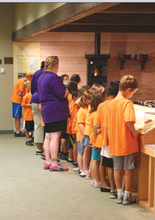
Kidz Academy Visits CWS