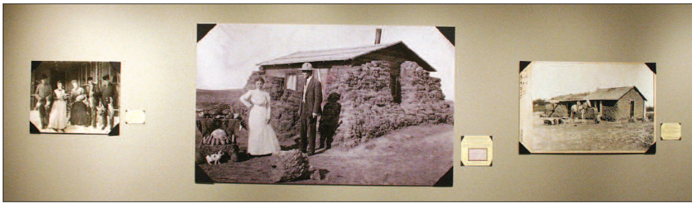
Historical photographs collected by Bob Kolbe on exhibit at CWS.