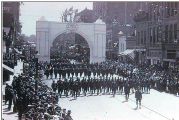
Troops returning from World War I to Sioux Falls, 1919.

With the international centennial of World War I approaching in August 2014, the Center for Western Studies will observe this momentous event by dedicating the 2014 Dakota Conference to the theme of The Great War and the Northern Plains . The conference is scheduled for April 25-26, 2014. Although the United States did not officially enter the war