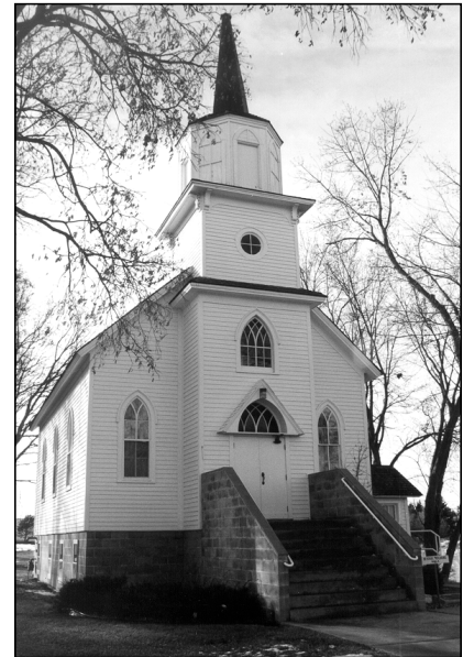
Historic Beaver Creek Lutheran Church Augustana Campus