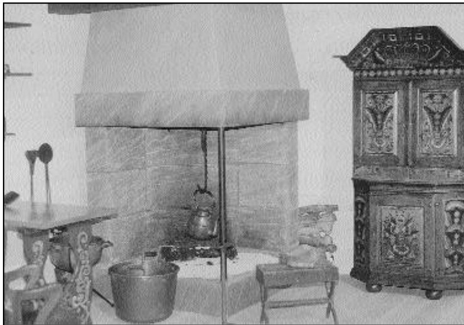
The fireplace and the 1805 Swedish kitchen cupboard are prominent in the Fantle Scandinavian Exhibit .

The construction of the Norwegian house replica is by Split Rock Studios, of Arden Hills, MN, and is made possible by a gift from the Nordland Heritage Foundation.