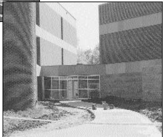
☛ May 8, 2001 - The Ode Link can be seen connecting the Fantle Building with Mikkelsen Library (left).

From 1:30 to 3:45 PM the Center will be open for small group tours, and the Gift Shop will be open for souvenirs and Christmas gifts.